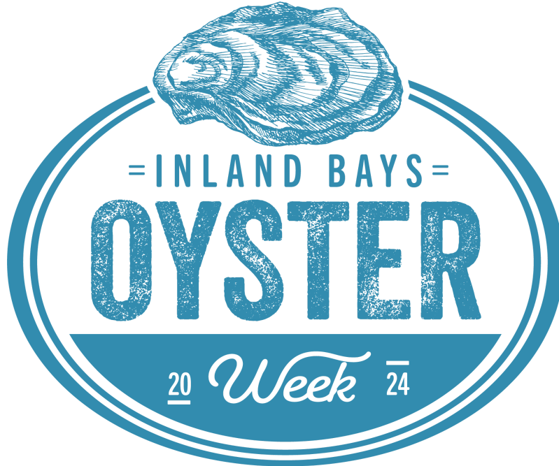
Inland Bays Oyster Week logo