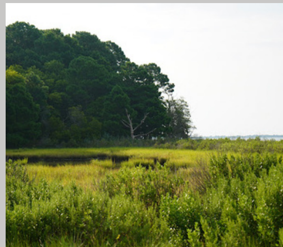
One of the TINP marshes