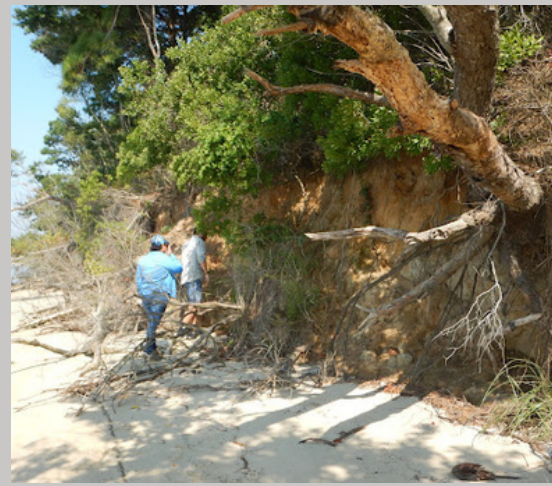
Eroding shoreline at the TINP