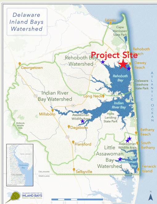
Map (left): Thompson Island living shoreline project (red star); other Center living shoreline projects (blue stars)

Although the site is not open to the public—and boats are not permitted to land on it's sandy beaches—the project will be publicly visible from the water and from Sunset Park in Dewey Beach.