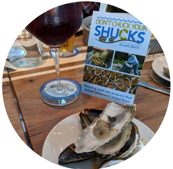
In 2021, 23 area restaurant partners participated in the program.

The program is funded by a combination of private donations and grants from the Delaware Department of Natural Resources and Environmental Control and U.S. Environmental Protection Agency. All fundraising activities are supported by private funds.