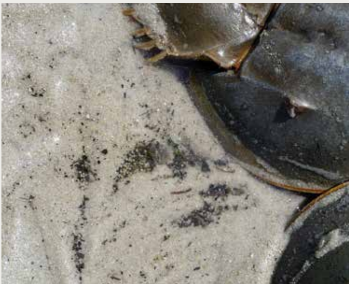
Horseshoe crab and eggs

This tagging study has demonstrated that a tremendous amount of mixing among horseshoe crabs occurs between the Inland Bays and Delaware Bay, with some crabs even switching locations! In fact, 55% of resighted crabs that were tagged in the Inland Bays have been reported living in the Delaware Bay. Most importantly, the Center's work shows that our Inland Bays horseshoe crabs are a critical part of the Delaware Bay region's population. The data collected can assist fisheries managers in making decisions about stock levels and harvests on the mid-Atlantic coast. →