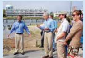
Making Strides with Stormwater Treatment, see page 4.