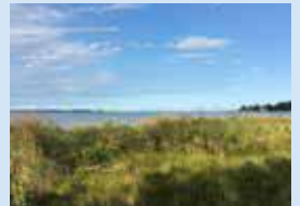
The James Farm Master Plan, see page 3.