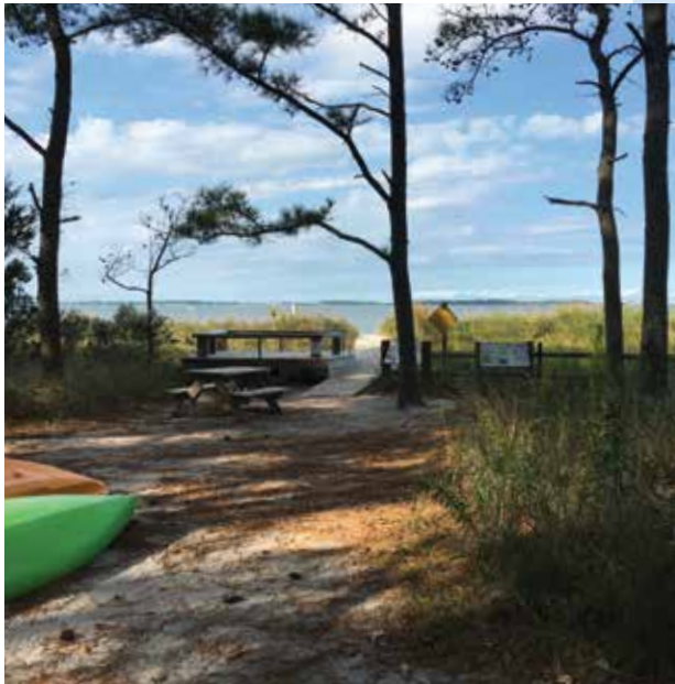
The James Farm trails and beach provide valuable recreation to thousands of visitors each year!