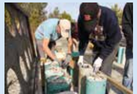
"Friend of the Bays" Award Winners, see page 7.

The Inland Bays Journal is a publication of the Delaware Center for the Inland Bays. The CIB is a nonprofit organization and a National Estuary Program. The purpose of the Inland Bays Journal is to educate and inform citizens and visitors to the Inland Bays watershed about this "estuary of national significance."